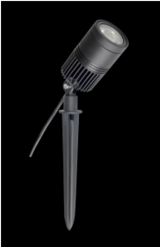
MY 80001-AI-LED (Aluminium)